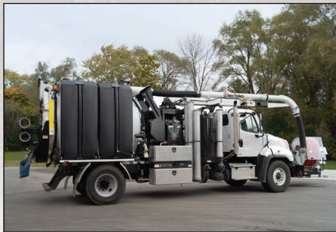
Camel 900 Dump