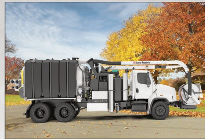
Camel 1200 Dump Camel 1200 Eject Camel 1200 Wastewater Recycle