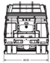
Model shown with optional equipment. Design and specifications subject to change without notice. Specifications may vary depending on chassis type.