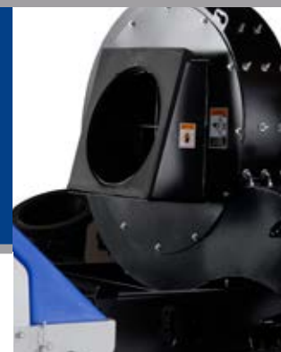
Whisper Wheel™ Fan System