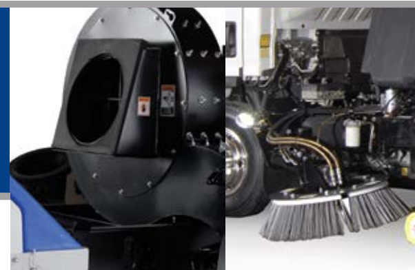
Whisper Wheel™ Fan System